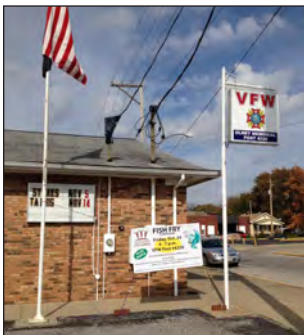
Thank you VFW Post #4226