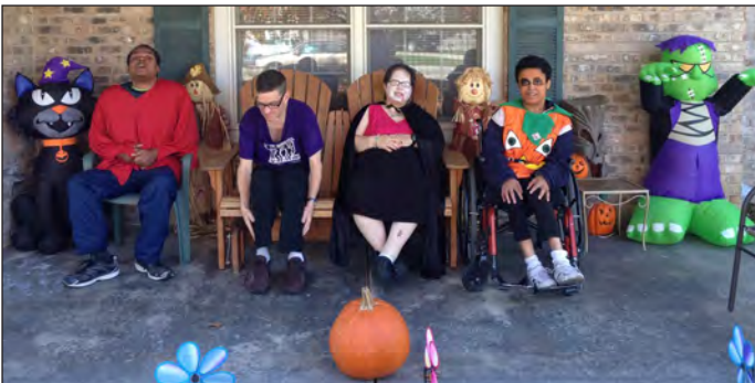
Whitetail CILA in their Halloween costumes!