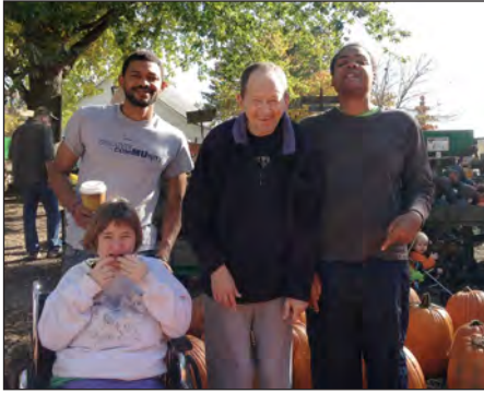
A beautiful day at the pumpkin patch