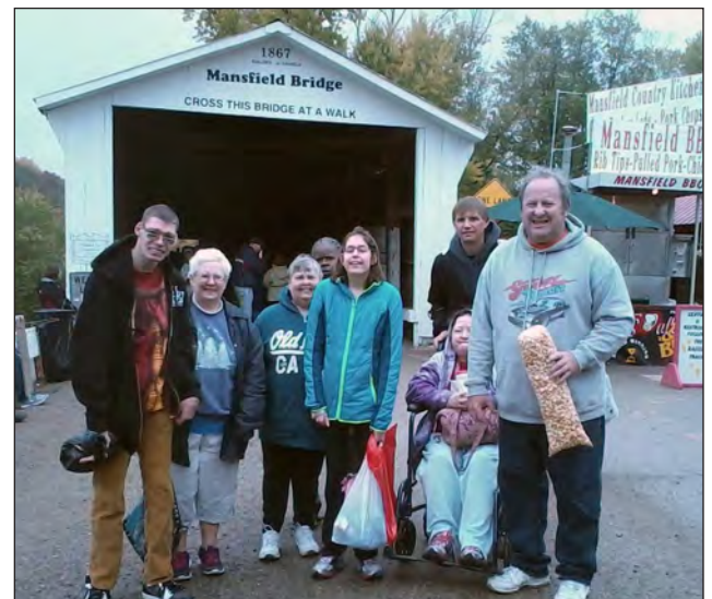
Covered bridge festival in Mansfield, IN