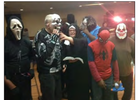
Homewood office Halloween Party