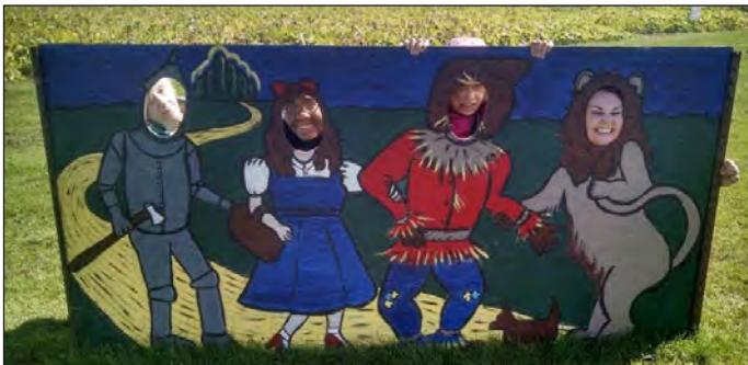
Tons of fun at the Pumpkin Patch!