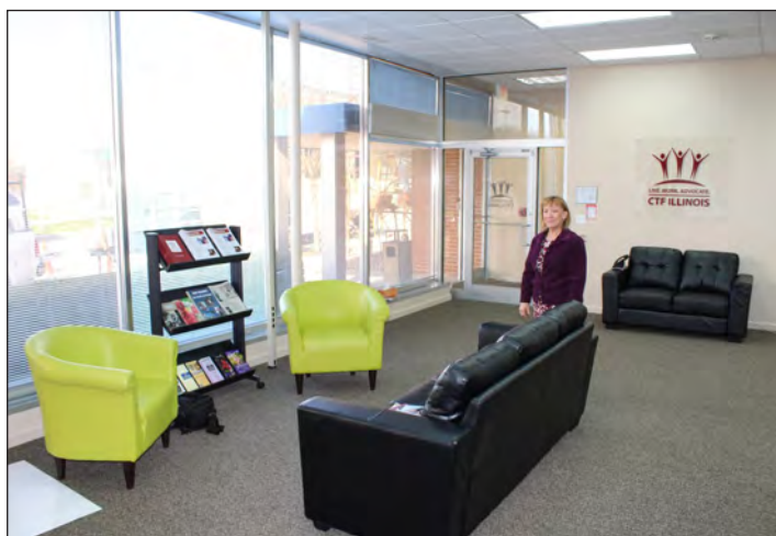
Front entrance and lobby of the new Advocacy Center

and projects to guide their efforts. Their first major project was a timely campaign entitled "Get Out to Vote". Their target audience for the campaign was CTF ILLINOIS Employees. This internal campaign utilized flyers, shirts and posters and told why voting is your right and why it is so important to us and our democracy.