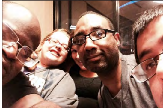
Elevator selfie at the SABC Conference in Oklahoma