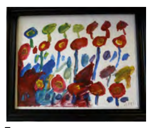
FLOWER GARDEN BY APRIL

The 9 Muses art studio is an art therapy program for individuals served at CTF. This new program is designed with a specific purpose in mind: to educate each individual in