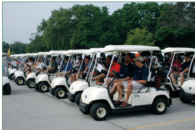
Golfers at last year's Classic get ready to hit the course