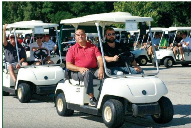
Golfers at last year's Classic get ready to hit the course