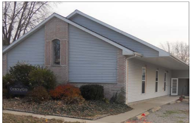
The new CILA in Lincoln will open during the month of December. The site, located at 1415 4th Street, is a renovated church that was acquired to replace the Karen Court CILA in Atlanta, IL.